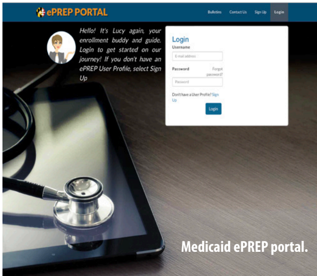
Medicaid ePREP portal.