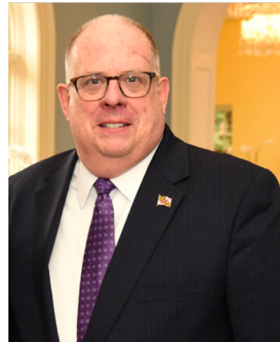
Executive Office of the Governor.